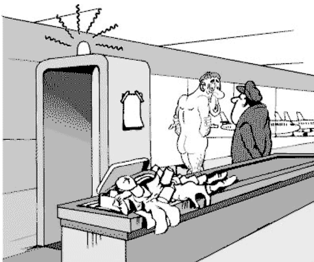
The only metal left is the filling in my teeth, I think !!

"I just told her that this section of the plane doesn't go to California."