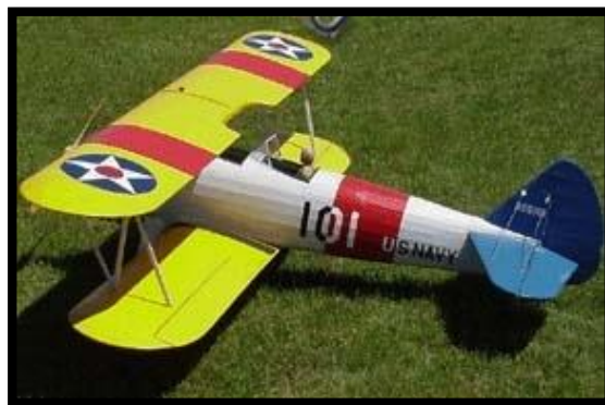
Plane looks like this when built