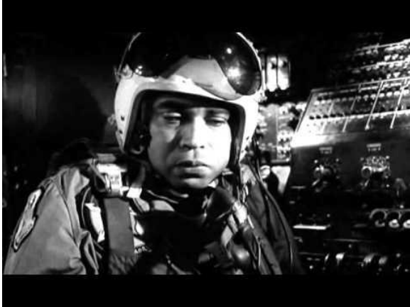
James Earl Jones